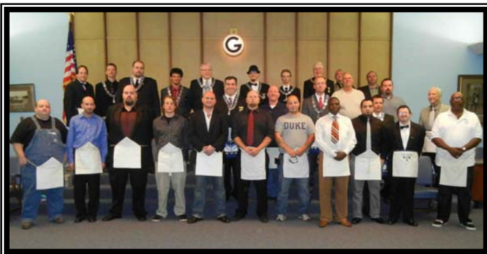
Entered Apprentice Degree on September 19, 2011. Nine New Members, Officers, and Distinguished Guests.