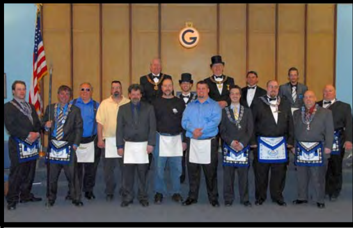
Master Mason Degree at Arcana Lodge, May 11, 2013

the completion of their degrees and welcome them to Arcana Lodge. They have all shown that they will be great additions to Masonry and active members of Arcana.