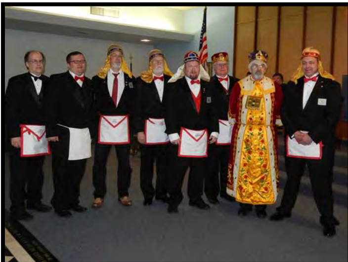
At Arcana's Stated Meeting on Monday, May 13 th , 2013 the Royal Arch Masons of Anoka-Shekinah #104 presented the Past Master Allegory.